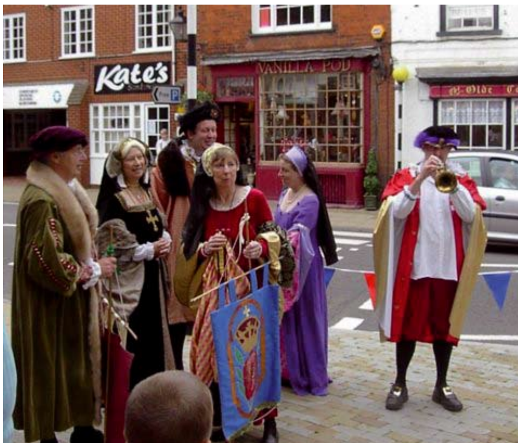
Aragon Day Tudor Costumes

The Alameda Sports Hall is well used for a number of sports, but availability is limited by the needs of Alameda School during school hours. This is not a very satisfactory situation as the Hall needs money spending on it to carry out certain repairs and could be incorporated into a new development. Other activities are well catered for at Flitwick Leisure Centre and it would be unrealistic to duplicate certain facilities in Amphill such as a swimming pool.