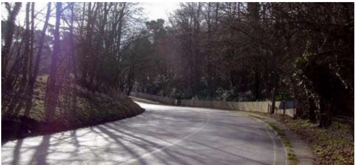
Entry to Ampt Hill Looking towards Bedford Street

There is a strong demand for reopening Ampt Hill station (80% of the 1100 responding to the 2004 questionnaire). Obstacles abound including the short start-stop distance between a reopened Ampt Hill station and the existing Flitwick station, cost and Thameslink’s involvement in providing a station to serve the Elstow/Wixams development. A stronger case can be made for developing a combined Flitwick/Ampt Hill Parkway station sited near the railway bridge over Froghall Lane. It would be within walking distance of major residential areas in both Flitwick and Ampt Hill with good links via the Ampt Hill bypass to neighbouring villages such as Ridgmont, Maulden and Clophill. It would also serve as a collecting point for visitors choosing to travel by rail when visiting Woburn Abbey and Safari Park and possibly Center Parcs and the National Institute for Research in to aquatic Habitats (NIRAH) in the future.