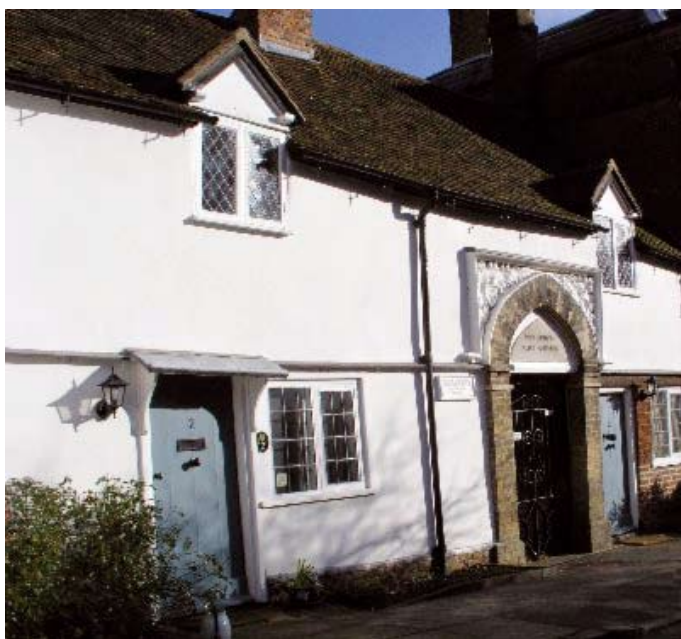
The Feoffees Alms Houses

The Responses to the questionnaire ANNEX B showed that the main types of additional housing required were starter homes and low cost homes (41%), adapted and sheltered housing (13%), other owner occupied (13%), restricted sale to local people (11%), no more housing (10%), private rented housing 2%. The responses show a concern that there is too much pressure to build speculative executive housing and too little pressure to build affordable housing for local people. Such a diversification in the housing stock would strengthen the local economy by providing affordable housing for key workers. This need is part of a similar problem experienced across the Mid Beds District where house price inflation is outstripping increases in earnings. There is no easy solution that can be placed in the Town Plan. However, one suggestion that has been made is that a contingency plan should be drawn up to bid for any chance offer of funds to be spent on housing in the town, for example from legacies or other sources.