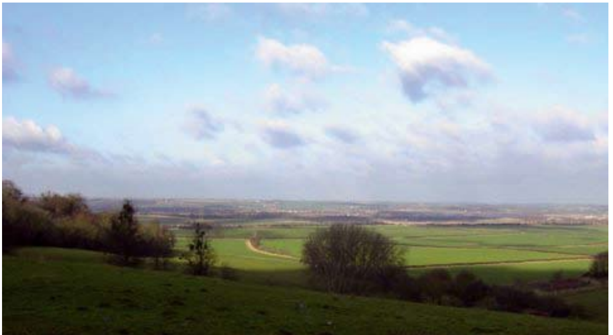
View over Greensand Ridge

We also support the Greensand Trust in its proposal to create a new area of parkland (provisionally known as the Flit Valley Country Park) to the west of the Maulden, Flitwick Road on either side of the A507, part in Ampthill and part in Flitwick.