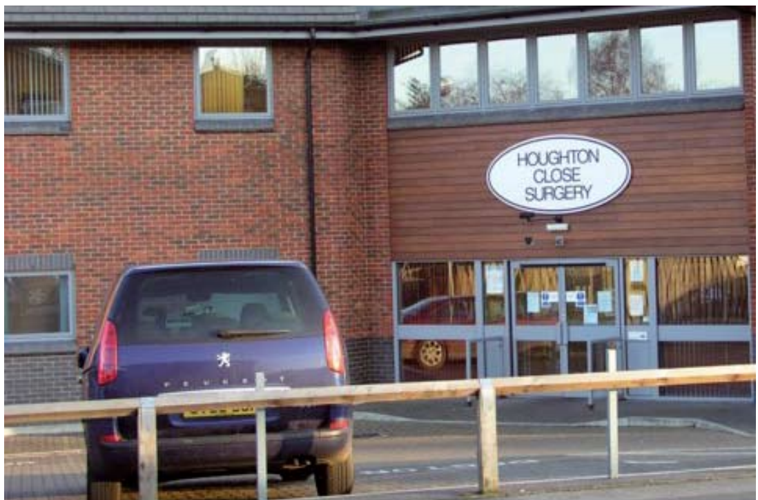
Houghton Close Surgery

In our questionnaire over 700 of you saw the need for a Good Neighbour Scheme that has been set up, and the response from volunteers has been very good.