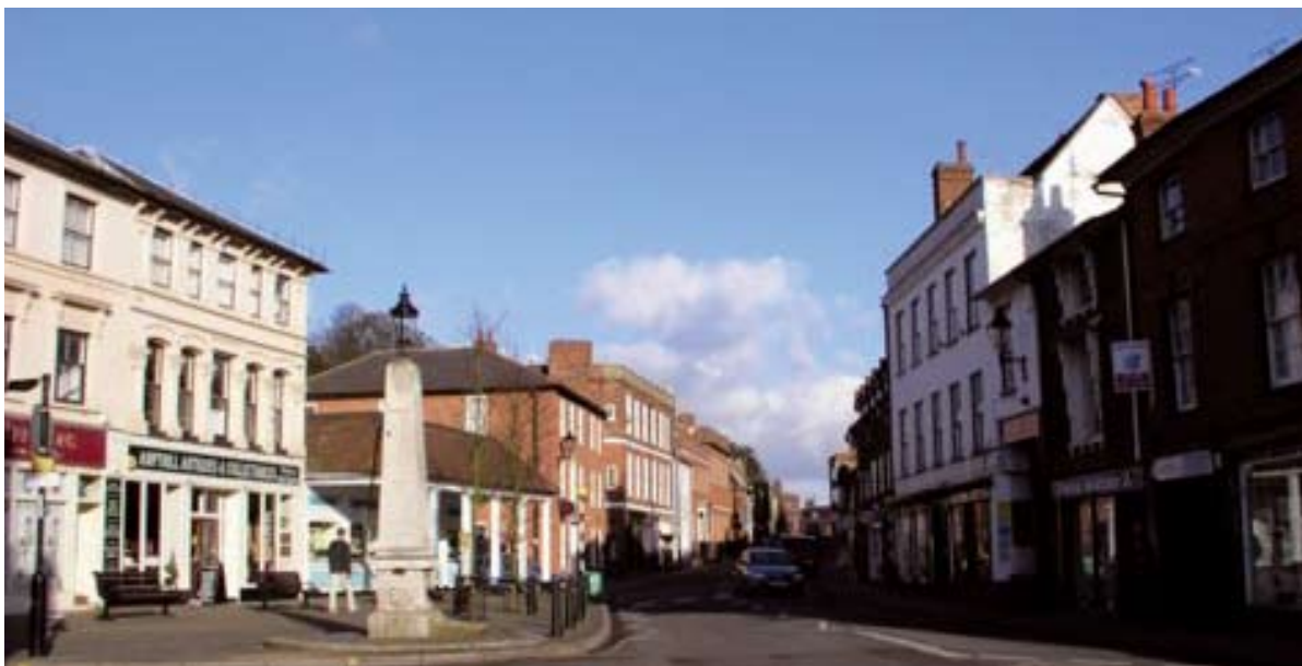
View of Market Square looking into Church Street.

A full version of this report is at ANNEX A – Business and Retail Development Focus Group Report