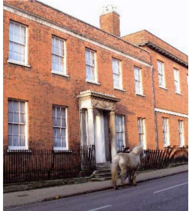
Ossory Thatched Cottages, Rhododendrons - Kings Arms Path Gardens and Avenue House with Pony